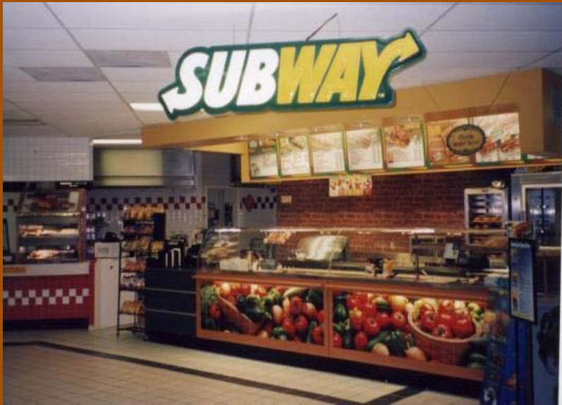
Stop-N-Go Convenience Store, Quincy, MI USA