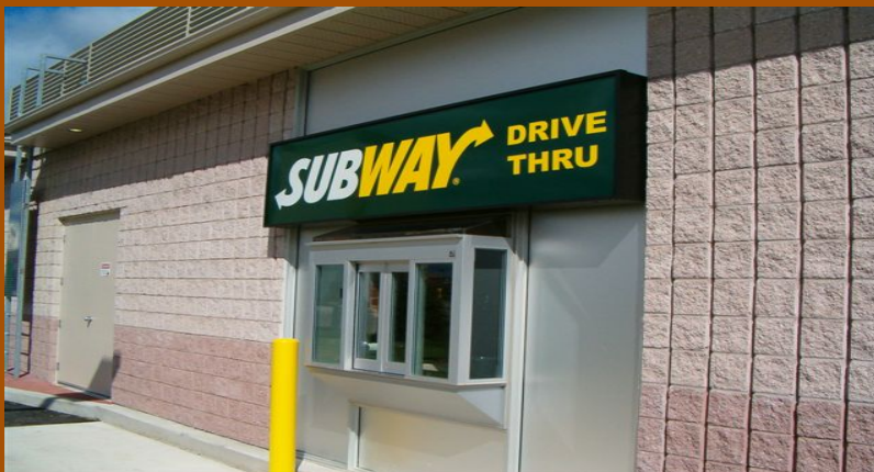
Esso C-store/Gas Station Drive Thru, Brampton, ON, CAN