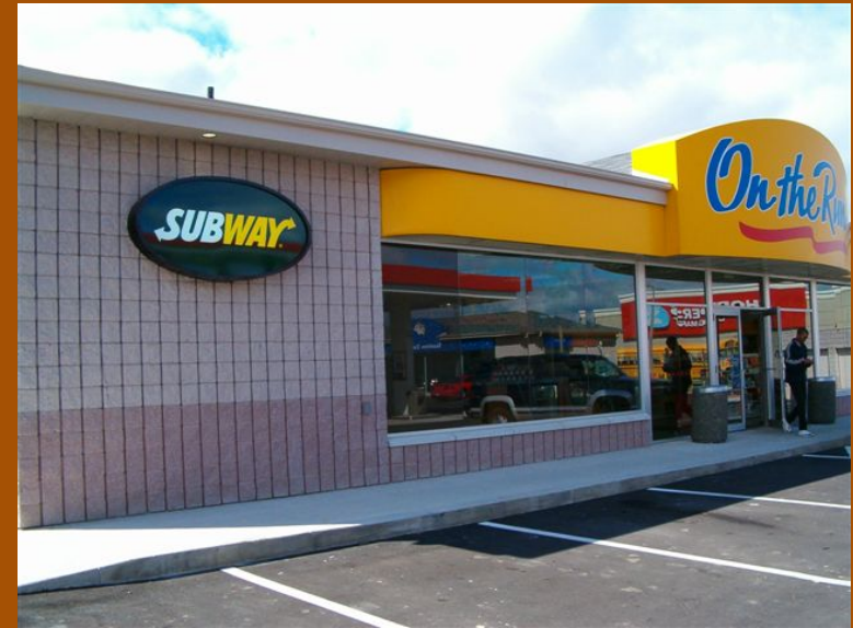
Esso C-store/Gas Station Exterior, Brampton, ON, CAN